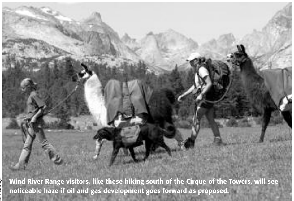
Wind River Range visitors, like these hiking south of the Cirque of the Towers, will see noticeable haze if oil and gas development goes forward as proposed.

Talking to People Across the State. County fairs, community gatherings, slide presentations, and kitchen-table conversations brought in new ideas and new members to the Wyoming Outdoor Council this past