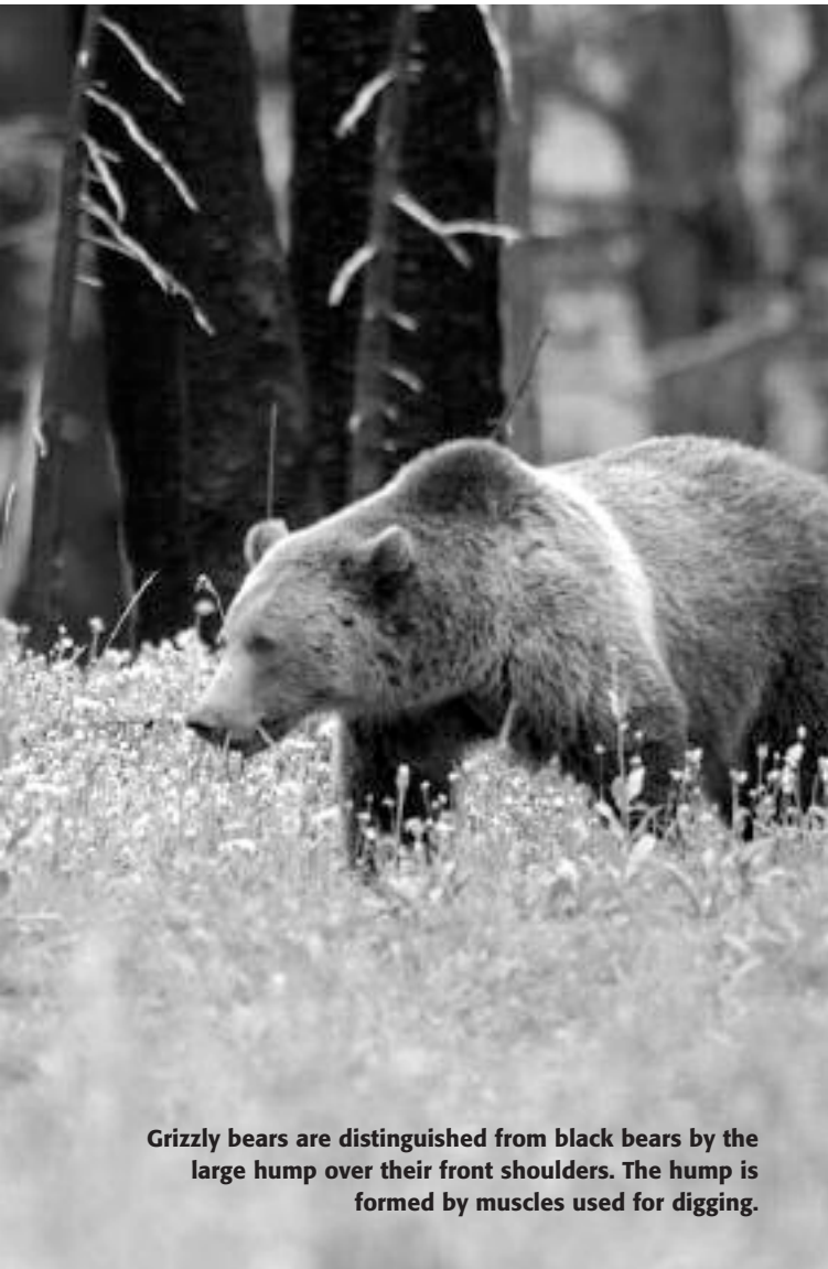
Grizzly bears are distinguished from black bears by the large hump over their front shoulders. The hump is formed by muscles used for digging.