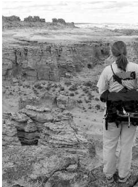
A hiker gazes out over Adobe Town.

Woyciechowicz has been working non-stop to gain public support for conservation in the Great Divide, and to promote the Western Heritage Alternative, which was written by concerned Wyoming citizens as a balanced alternative to the BLM's call for