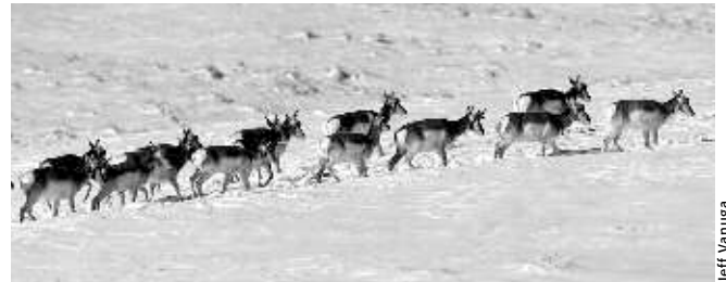
A small band of pronghorn make a biannual pilgrimage between Grand Teton National Park and the Upper Green River Valley, the longest migration path still in use in the lower 48.

We are working now to find solutions to the problems cited in the appeal. If our recommendations are applied, the Bridger-Teton National Forest could provide adequate forage for wildlife habitat on the Upper Green while still allowing for responsible livestock grazing. Contact: Meredith Taylor