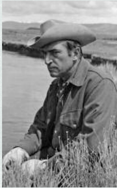
Luna Leopold, here in his 50s, sits on the banks of the East Fork River near Boulder, Wyo. (Photo circa 1974.)

Dr. Leopold had a ranch in the Upper Green River Valley. It just so happened that he was also one of the foremost hydrologists in the country. His work as an ecologist and his studies of American rivers had provided new insights into the hydraulics of moving water. He immediately became interested in the plan to dam the Green and transport large amounts of its waters across the Continental Divide