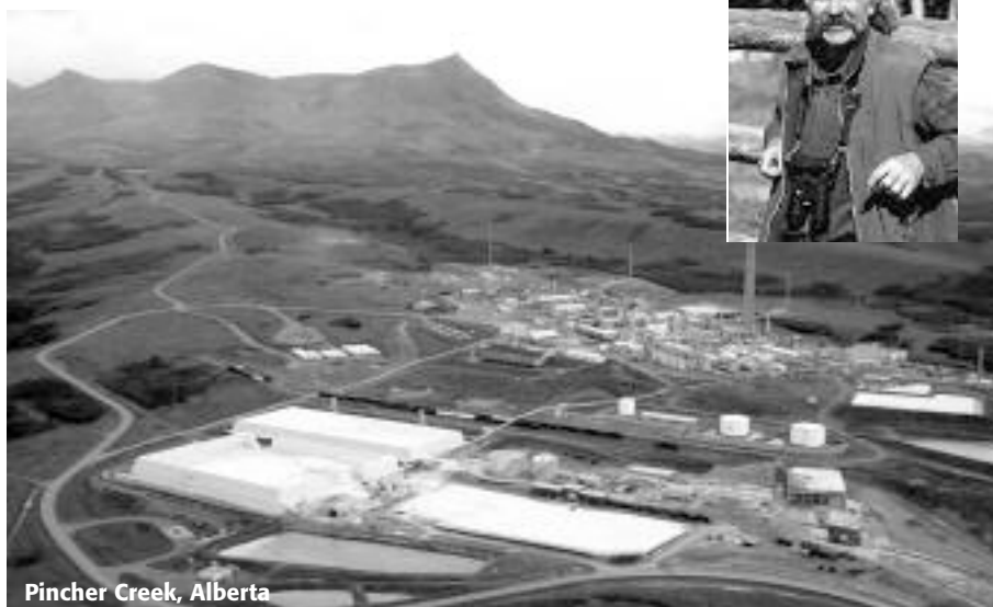
Pincher Creek, Alberta