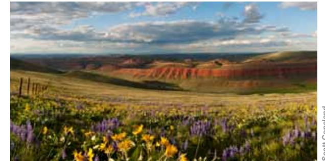
Red Canyon Scenic Overlook