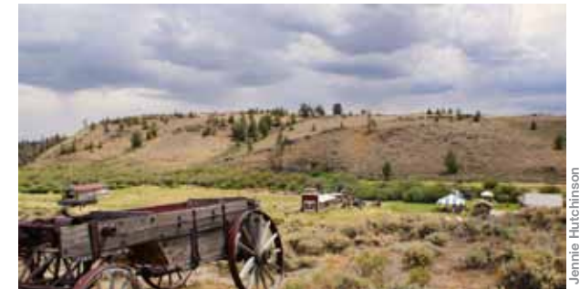
South Pass City State Historic Site

More information on these driving tours is available at windriver.org