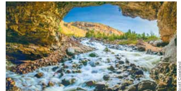
Sinks Canyon's Disappearing River