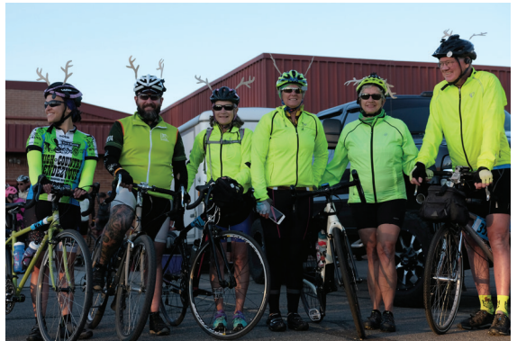
As part of this year’s Tour de Wyoming, we provided felt antlers that cyclists attached to their helmets to raise awareness of threats to the Red Desert to Hoback mule deer migration corridor.