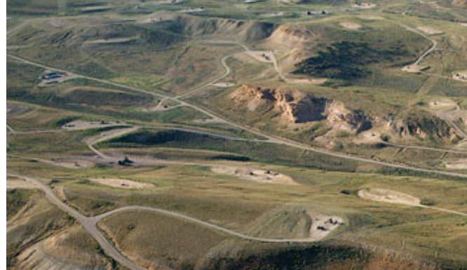
An aerial view of the natural gas field in LaBarge, Wyoming.